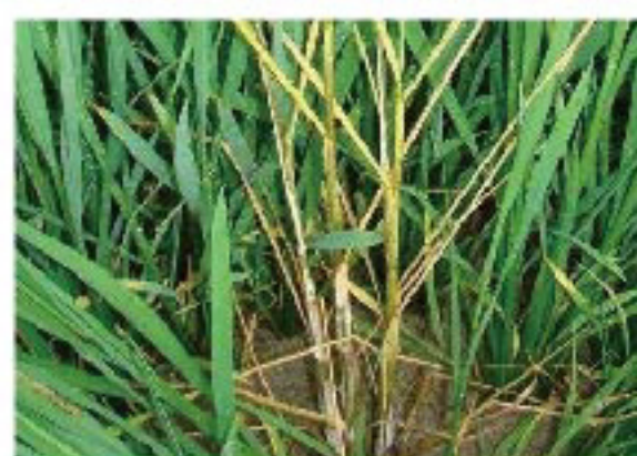
Rice bakanae disease