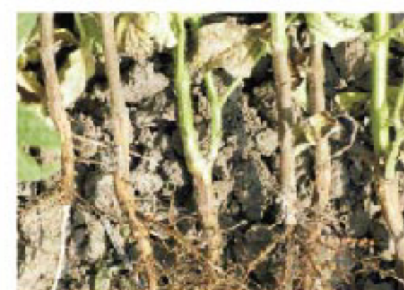
Soybean root rot